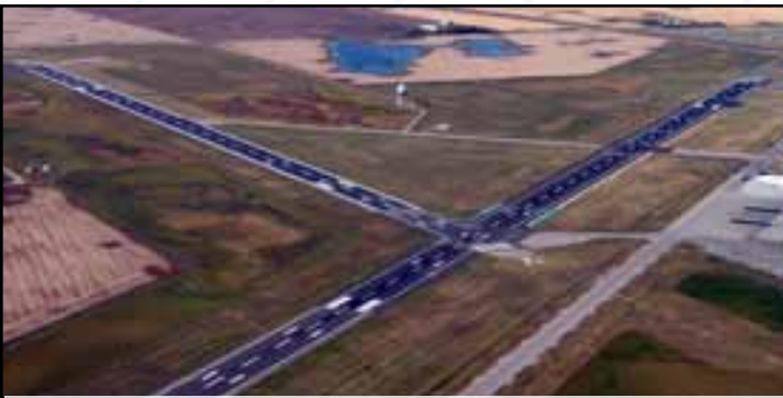
Aerial photos of the newly resurfaced runways

the safety margin on takeoffs and landings, and to anticipate future Transport Canada regulations.