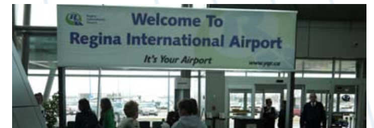
>>> MOBILE KIOSK

FLIP CHARTS- $5 | TV/VCR/DVD - $10 | OTHER SUPPLIES AVAILABLE | 20% DISCOUNT TO AIRPORT TENANTS