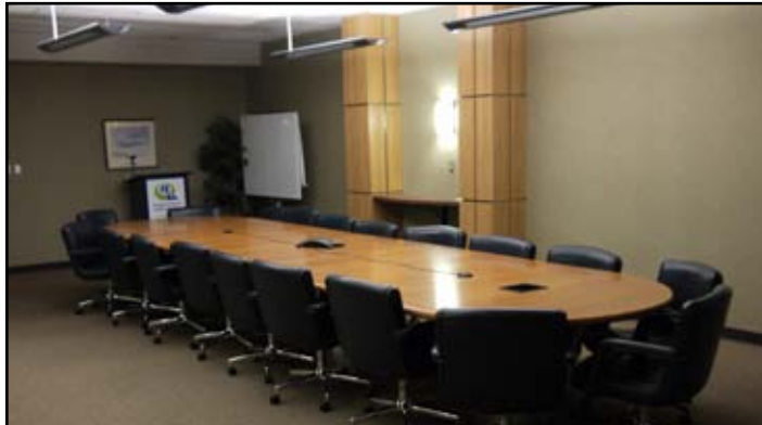
>>> RAA BOARD ROOM

Location: at front of RAA Admin Office (#1-5201 Regina Ave.) Size of Area: 34' x 19' Numbers Accomodated: 10-30 people Support Capabilities: projector and screen, wipe board, teleconferencing available (room phone # is 306.761.7483), plug ins available, Wi-Fi and hard-wired internet access, coat rack in room, separate exit to main terminal