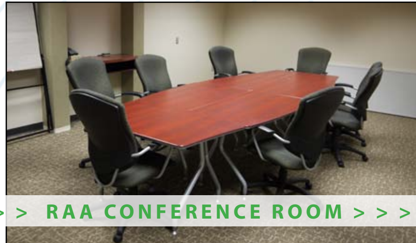
>>> RAA CONFERENCE ROOM

Location: down south hallway beside RAA Admin Office (#1-5201 Regina Ave.) Size of Area: 24' x 19' Numbers Accomodated: 20-30 Support Capabilities: projector and screen, wipe board, plug ins available, 3 tables, Wi-Fi and hard-wired internet access, separate entry/exit to main terminal