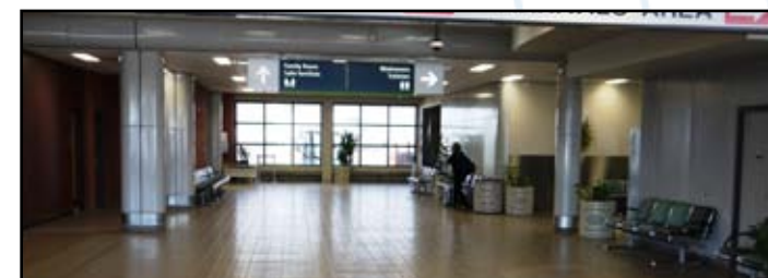
>>> DISPLAY AREA

Location: south concourse, main floor of terminal Size of Area: 70' x 20' Other Info: plug ins available, Wi-Fi access Charge: $300 per event - Commercial Use FREE - Community Service