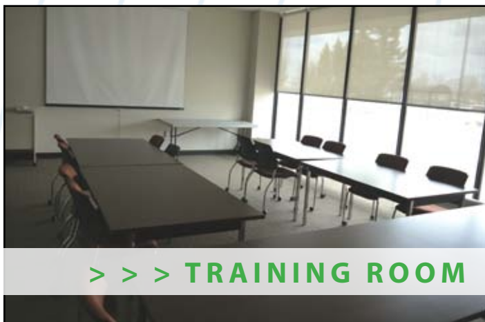
>>> TRAINING ROOM

FLIP CHARTS- $5 | TV/VCR/DVD - $10 | OTHER SUPPLIES AVAILABLE | 20% DISCOUNT TO AIRPORT TENANTS