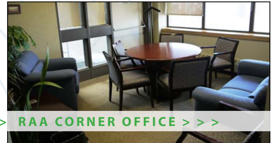
>>> RAA CORNER OFFICE